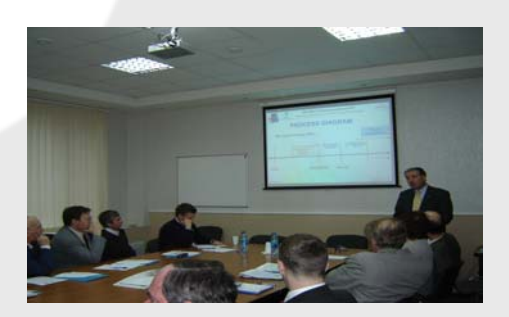
FP7 workshops in Russia (Moscow and St Petersburg)